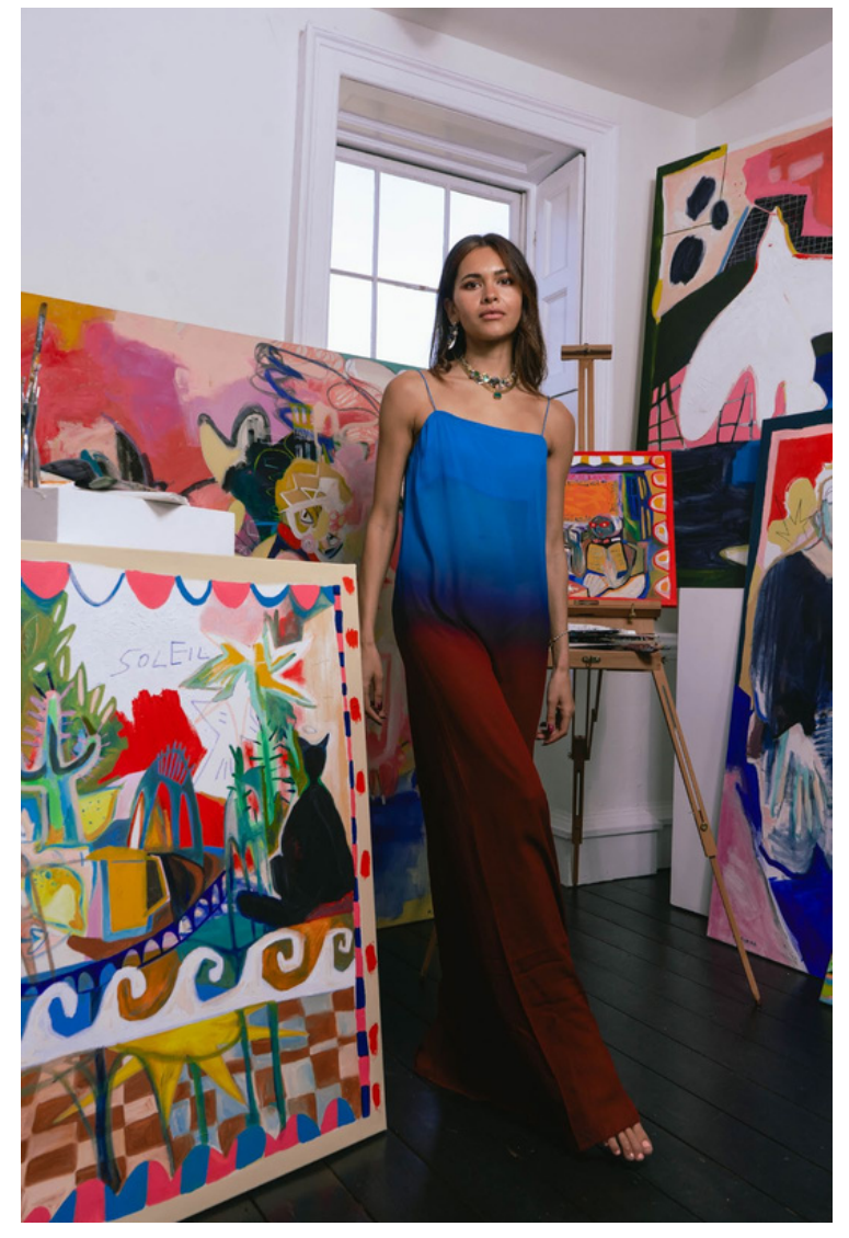
"My ambition is to create a space to enter, wander and inhabit- ones that both engages and eludes the viewer."